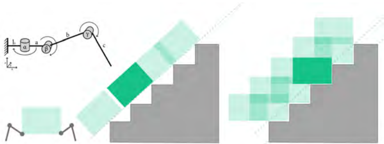
Fig. 2. Two possible body poses for stair climbing robots with sagittal leg constellations. The simplified image shows the closest positions in contact with the stair outline. The tilted approach is found more often than a constant horizontal position (r.).

workspace covers the stair area (similar to mammalian topologies). In comparison, insect-like arrangements allow a better foothold but under-perform if bodies have to be pushed upwards and forwards. For the next step, we will assume the robotic legs will be placed parallel to the sagittal plane. Selecting the body pose - Even though most stairs have regulatory obligations to remain within a certain range of height (this also counts for slopes) no works have been made to link the design process directly to these rule sets to define robotic lengths. We are looking at the case with the least favourable body orientation: The robot body is in direct contact with the stairs. This orientation can either be parallel to the stair inclination or horizontal (as sketched in Fig. 2).