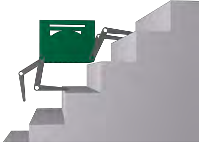
Fig. 5. A highly unfavourable pose: the centre of mass is aligned directly above the footpoints while the lower limb itself is arranged orthogonally.

Having finished the theoretical part of the calculations, one would need to add a first estimate of the robots mass to the equation (6). This is necessary and part of every design process: later calculations or materials will most like (and as in our case) change the final numbers the torque values. We have picked an estimated mass of m_{total} = 15kg as initial guess from experience. This step may vary depending on the planned robotic setup, payload and material. Adding this to the equation results in T_{max} = 32.373Nm (for our segment length of 0.22m).