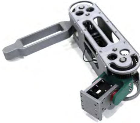
Fig. 7. The final manufactured leg. The initial aluminium parts were manufactured in FDM (PLA base) to reduce weight furthermore.