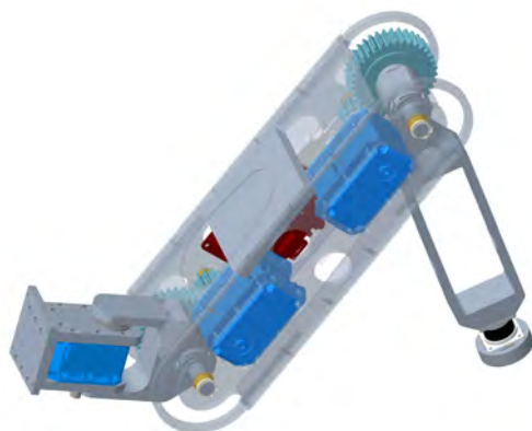
Fig. 6. A complete view of the robotic leg. The blue motors represent MX-106 model actuators. The dark red part is an integrated Raspberry Pi 3 for decentralized task handling.

minimum required leg length was proposed as well. The method links the robots legs length to the geometric values of stairs and can be applied for any robot with such climbing tasks. Future works can mainly be seen in the development of a more detailed formula for stair climbing. The presented use-case only covers a part of the robots possibilities and needs further elaboration. Using this concept on rocky terrain is planned in the future but requires geometric abstraction of the terrain. Such design formula would allow the calculation of the optimum length of legs with the knowledge of the terrain characteristics. Tests are planned with the first leg design (shown in Fig.7).