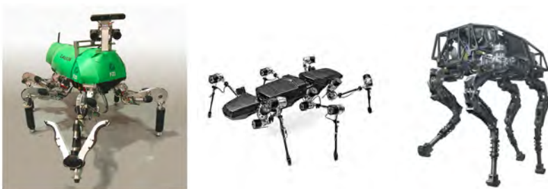
Fig. 1. Examples for different monolithic robot systems: (f.l.t.r.) LAURON V, 6 HECTOR, 7 BigDog. 8

the missing limb. Both represent inspiring qualities for robotics and are objective to many papers in the domain. There have been efforts in finding faster ways to recover from damage by exploring parameter spaces and avoiding diverging behaviours 3 or make use of artificial neural networks to learn new walking strategies. 4 The presented approach will more closely adapt the idea of decentralized behaviours. More exactly: it will propose a way of designing legs which house a decentralized computational unit for redundancy. A well known animal with such motion redundancy is the octopus. The behavioural and control hierarchy offers the capability to move limbs individually but overwrite signals to coordinate multi-limb movements (many controlled by individual brain lobes). 5 Walking robots can't be compared