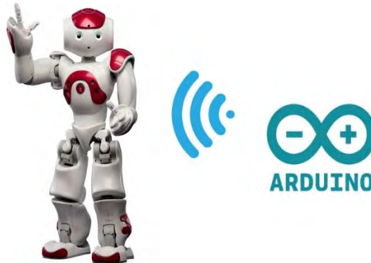
Figure 1- NAO robot

movement [8, 9]. NAO robot has been used to help autistic children in improving their behavior [10, 11]. The studied cases show that children suppress the autistic behavior during human-robot interaction and they can maintain visual contact with NAO [12]. NAO robot participate in RoboCup (the World Championship of Robotics) as a soccer playing NAO robot. It has been the star of the Standard Platform League where robots are expected to operate fully autonomously [13, 14].